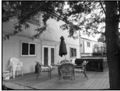
4437 S Vivian St - $209,900 Morrison, CO Two Story