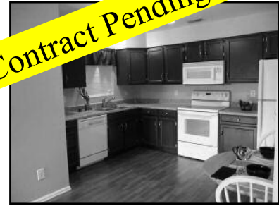
3600 S Pierce St #6-204 $59,900; 1 Bed & 1 Bath Academy Pointe