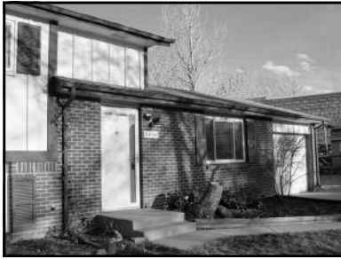
5056 S Yank Ct - $210,000 Bellevue Ridge Park Like Yard