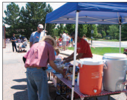
Hot dogs, chips and lemonade were served after the parade.

"Children reinvent your world for you." — Susan Sarandon