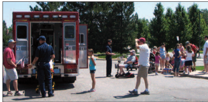
Residents check out the ambulance while waiting for the neighborhood picnic to begin.