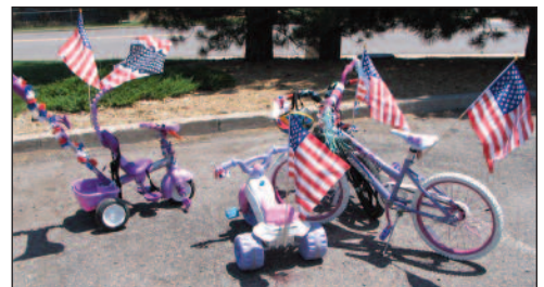
Lots of patriotically dressed kids and bikes at this year's parade!