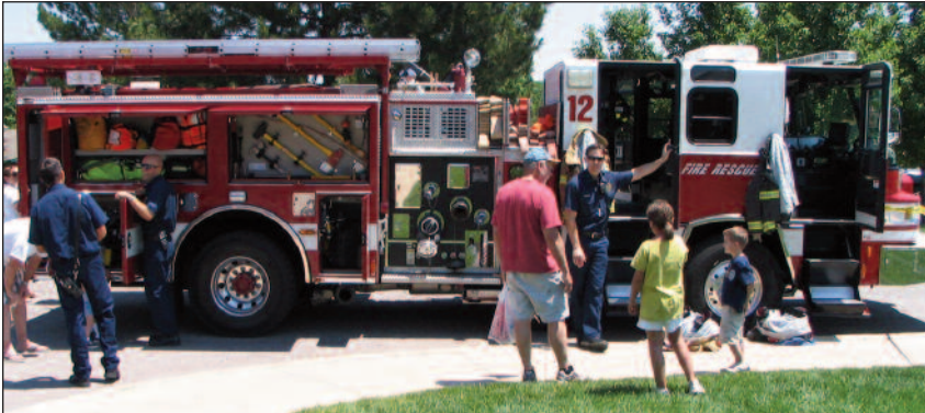
West Metro Firefighters talk to Kipling Villas families about their equipment.