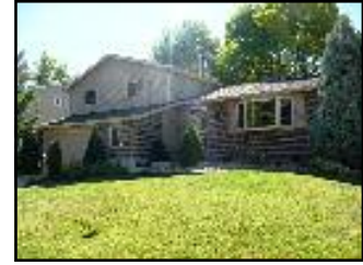
8822 W. Arbor Ave - $219,900 Kipling Villas Short Sale Special