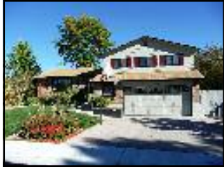
9903 W Caley Ave - $249,900 Kipling Villas Fantastic Home Backing to Greenbelt