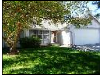
4437 S Vivian St - $217,900 Morrison, CO Solid Two Story