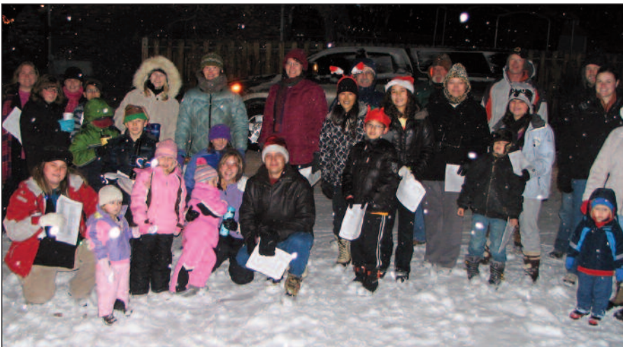
Group photo of this year's caroling bunch

This season's Christmas Caroling party was a huge hit with residents. The weather was snowy and chilly, but that didn't stop over 30 residents from joining together for a fun evening of singing and hot cocoa. This year, we visited homes in District 2 and 3, and were warmly greeted at nearly every door. It was a very fun and festive night. We hope you remember to join us for Cocoa and Carols in 2012!