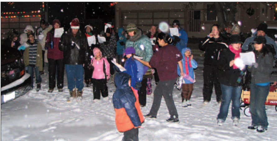
Our merry bunch singing in front of a resident's home