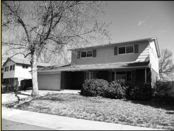
8773 W Arbor Avenue - $242,000

Gorgeous Richmond Two Story. 4 Beds Up! Hardwood Floors. Remodeled Baths, Newer Windows, Central A/C, New Concrete Drive, New Concrete Front & Back Porches. 1,941 Finished SF + 819 SF Unfinished in Basement