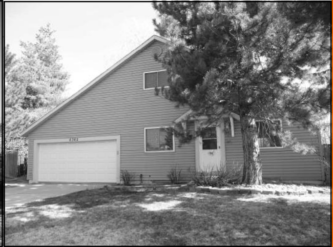
6362 S. Johnson Street - $199,900

Gorgeous Richmond Two Story. 4 Beds Up! Hardwood Floors. Remodeled Baths, Newer Windows, Central A/C, New Concrete Drive, New Concrete Front & Back Porches. 1,941 Finished SF + 819 SF Unfinished in Basement