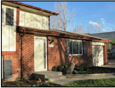
5056 S Yank Ct - $215,000 Bellevue Ridge Park Like Yard