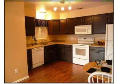
3600 S Pierce St #6-204 $59,900; 1 Bed & 1 Bath Academy Pointe