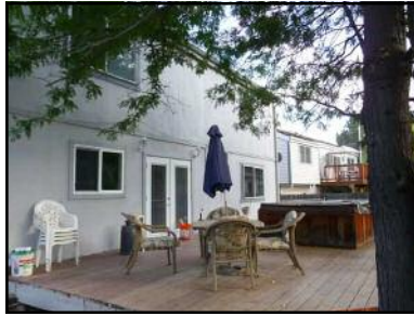
4437 S Vivian St - $209,900 Morrison, CO Two Story